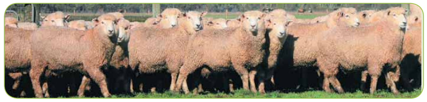
Eleven month old Wairere ram hoggets, July 2017.