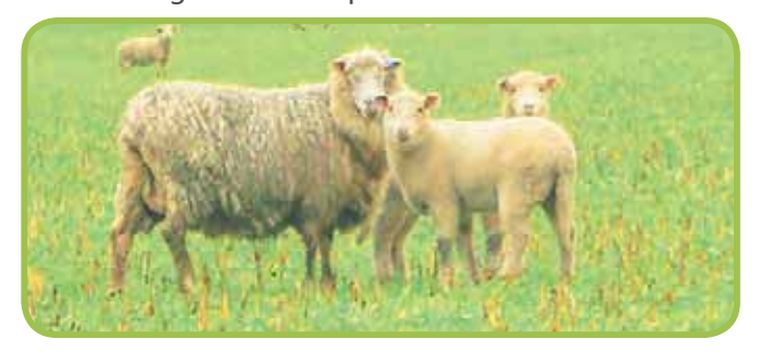
On Ewan Price's farm near Heywood: Wairere Romney/Border Merino ewe, early September.

Ewan Price, Heywood. runs 4,500 ewes and hoggets on 560 hectares, near Heywood Victoria, a stocking rate of under nine per hectare. But a lambing percentage of 145 and average carcase weight of 22kg, and a 90 percent contribution from the hoggets, delivers 310kg carcase weight and wool per hectare.