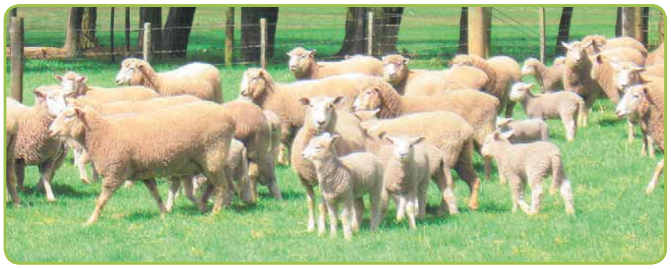
Wairere/Border Merino ewe hoggets at 13-14 months old, in September, with 150% of lambs. These hoggets have gone on to lamb 150-175% as adult ewes.

With around 1,000 Wairere rams air freighted from New Zealand to Victoria, Tasmania and South Australia since 2005, the Wairere advantages are becoming well known: