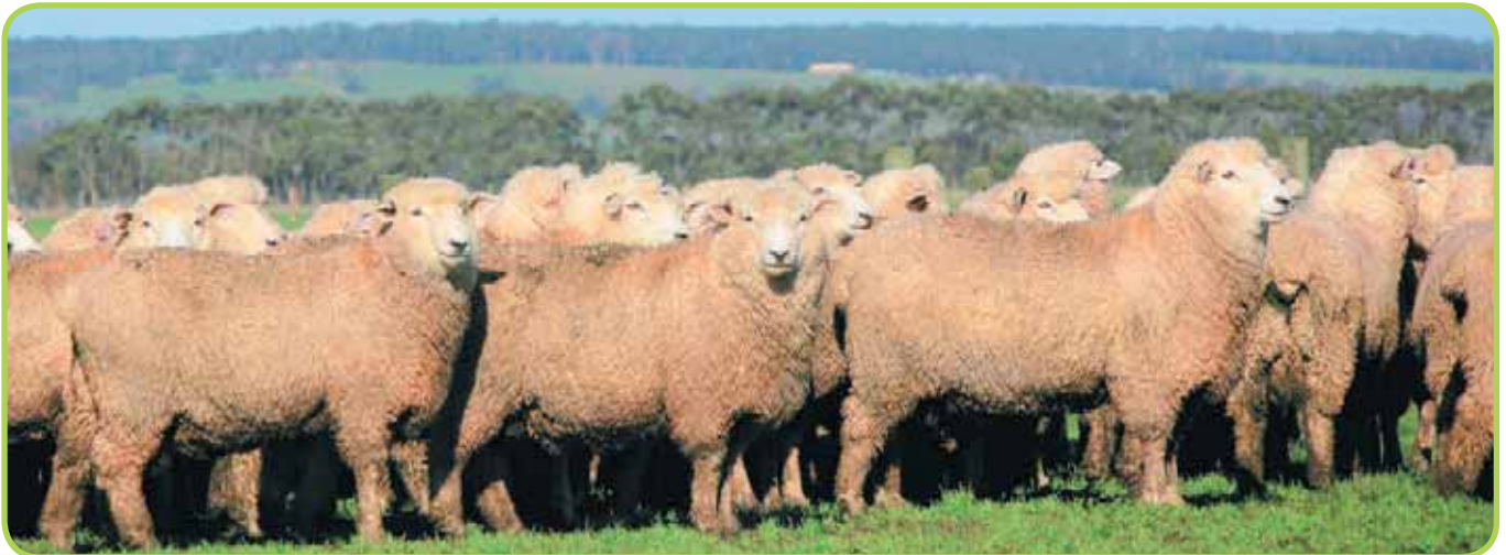
Eleven month old Wairere ram hoggets in Australia, July 2017.

Across the country the dams are all full and the freezers are all empty. To date, one contract for lamb supply has the schedule underpinned at $6.10/kg through to mid December. The mutton schedule has had a healthy lift recently, but is nowhere near the heights of the Australian schedule of $A5.36/kg in late May. An Australian meat industry executive, speaking at a recent farm field day in Southland, commented, "We were very disappointed back in 1973 when New Zealand scored a big quota of sheep meat into the EU, and Australia only a small tonnage. But it forced our industry to find other markets, and our product is now the dominant player in the USA and the Middle East." Within two to three years, on current trends, Australia will be exporting more lamb than New Zealand. New Zealand lamb tonnage to the EU has been steadily declining, as other customers are found around the world, and as production has reduced with lower ewe numbers and difficult seasons.